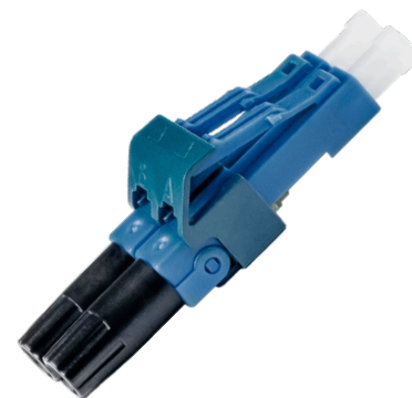
Clip installation on SSF-LC-SMUPC Single Mode connectors. Connectors sold separately.