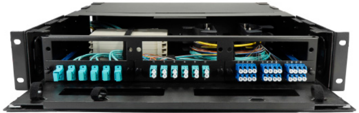
Enclosure shown with partial installation and front cover removed. Enclosures are sold empty.